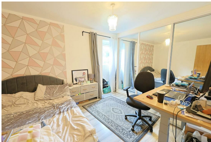
Bedroom One 13'10" x 9'8" (4.22 x 2.95)