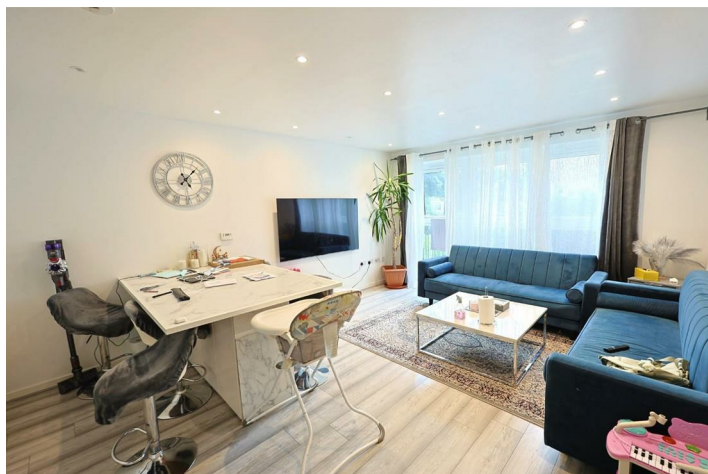
Reception 18'6" x 15'8" (5.64 x 4.78)